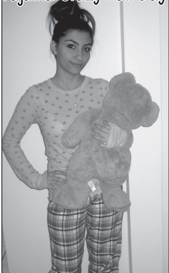
Pajama/Crazy Hair Day

With all the sleepy, bed-craving students we have wandering the halls of Glendale High; it's not a surprise that Pajama Day is as much of a success as it is. Not to mention the outrageous hairstyles we see on a daily basis, except, on this day, they are over-exaggerated just a tad.