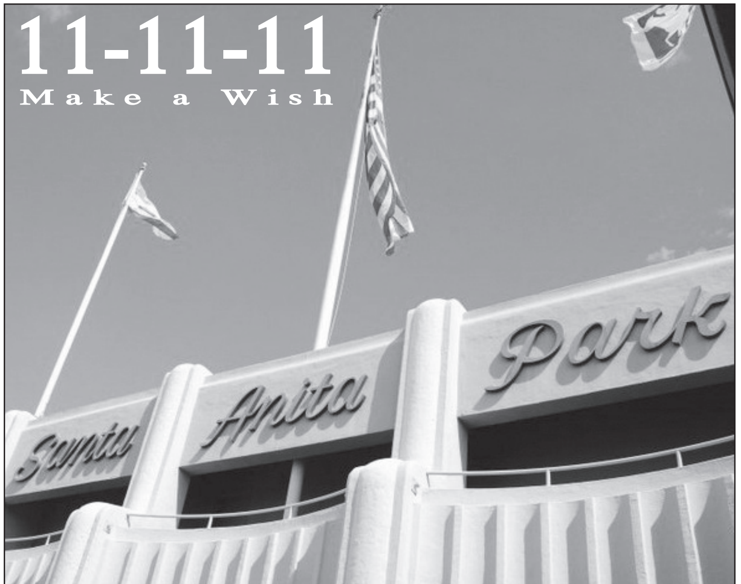
The Homecoming Dance will be held at Santa Anita Park in Arcadia on Friday, Nov. 11.

The dance is being held on 11-11-11, so it is scheduled to end at 11:11 p.m. Students can bring anyone from any other school that they please as long as they meet the requirements. It's going to be a one in a million exclusive party for Glendale High students.